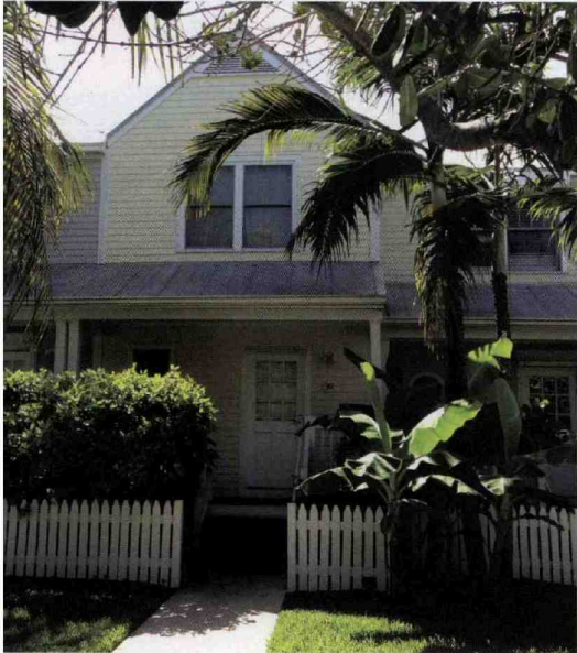
Sunset Village is one of the resort's villages.