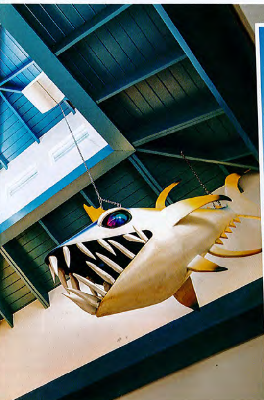
Coral Cay kids club