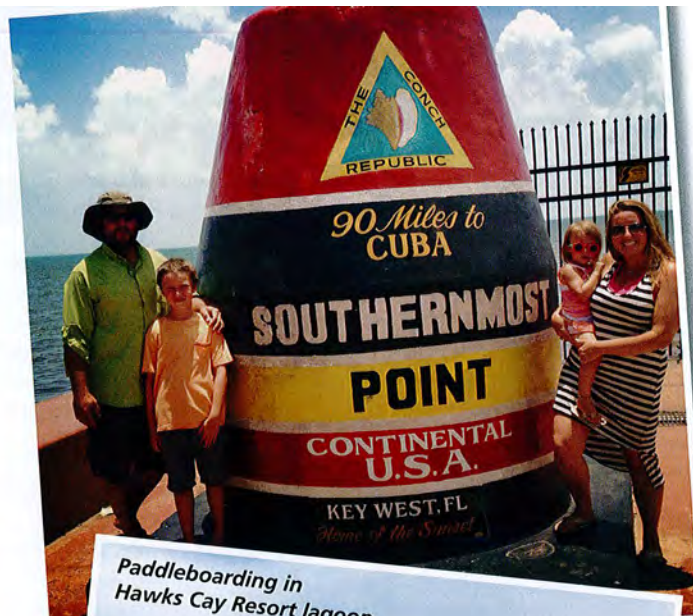
Paddleboarding in Hawks Cay Resort lagoon

Looking for a dolphin experience? Hawks Cay has an on-site dolphin research facility. You can pay to have a dolphin experience in the water or on the dock. But really, you don't even have to pay to see the fun dolphins from the Ocean restaurant's back deck. This is such a cool feature.