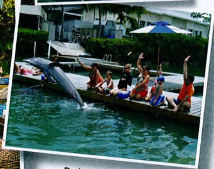
Dolphin Connection at Hawks Cay Resort