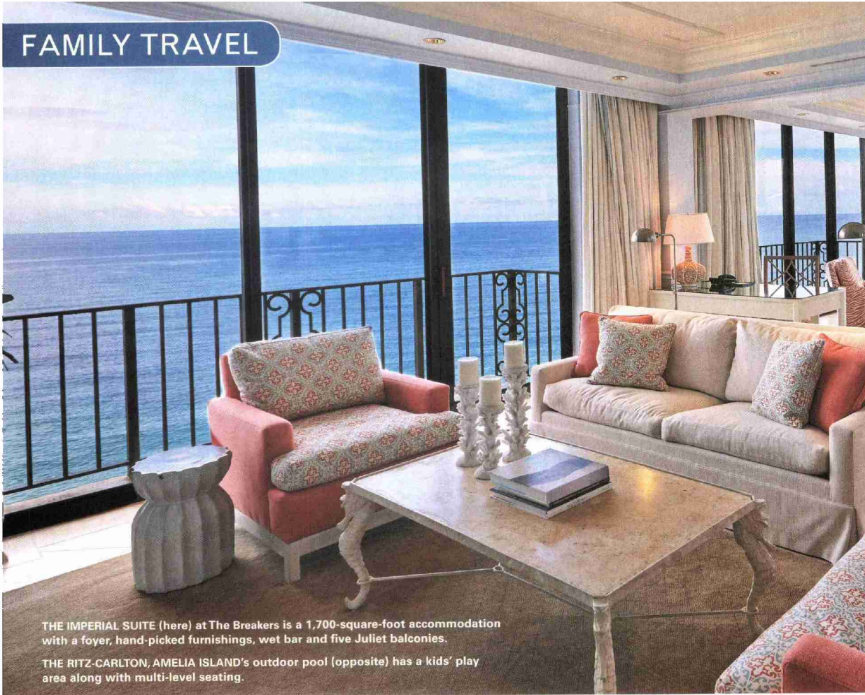
THE IMPERIAL SUITE (here) at The Breakers is a 1,700-square-foot accommodation with a foyer, hand-picked furnishings, wet bar and five Juliet balconies. THE RITZ-CARLTON, AMELIA ISLAND's outdoor pool (opposite) has a kids' play area along with multi-level seating.