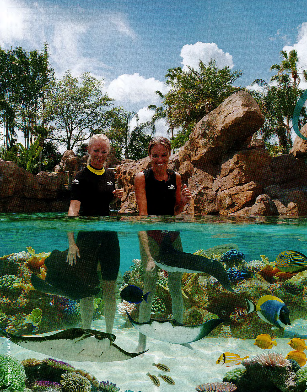
Discovery Cove in Orlando offers both sting ray and dolphin interactions.