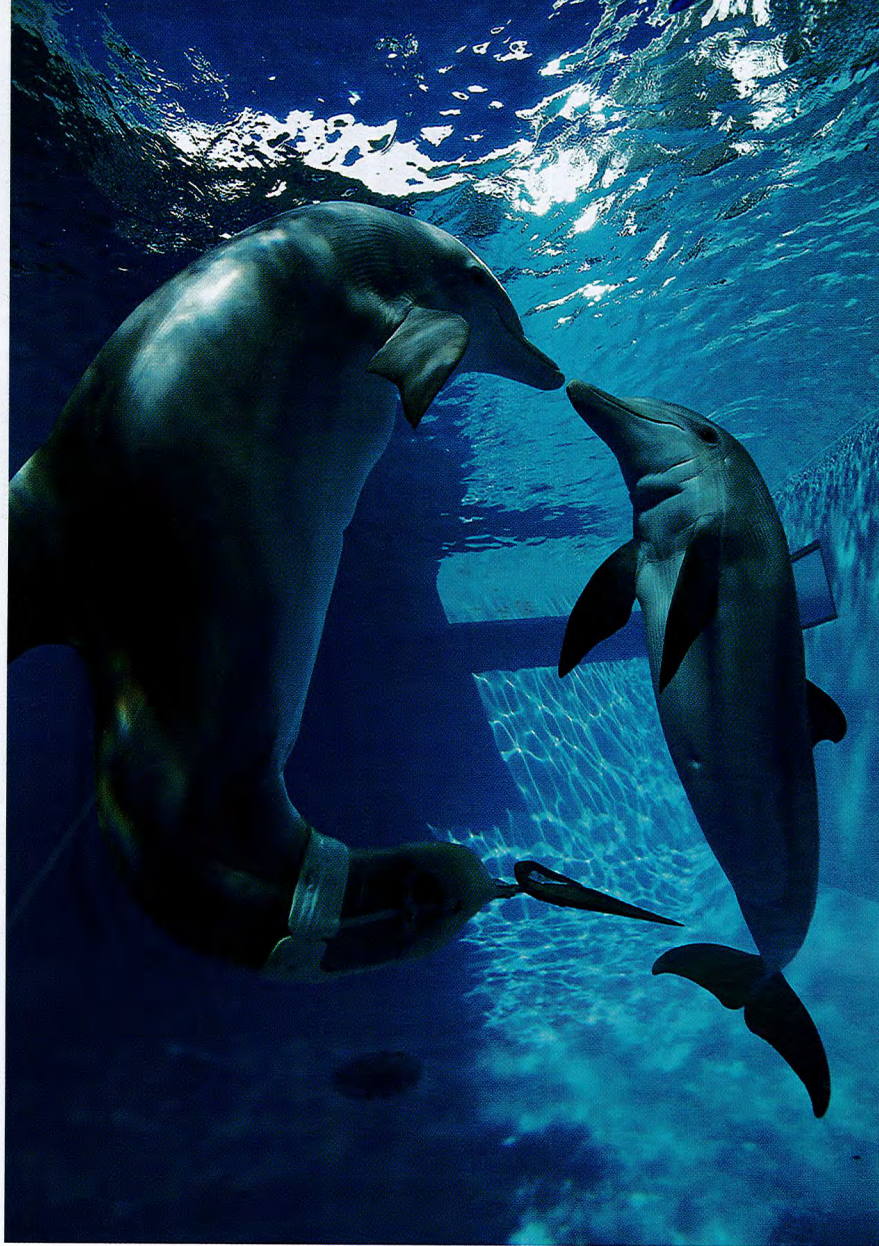
Clockwise from top left: Hawk Cay Resort's Dolphin Connection; Winter and Hope live at the Clearwater Marine Aquarium; Plantation Crystal River offers packages including swimming with manatees.