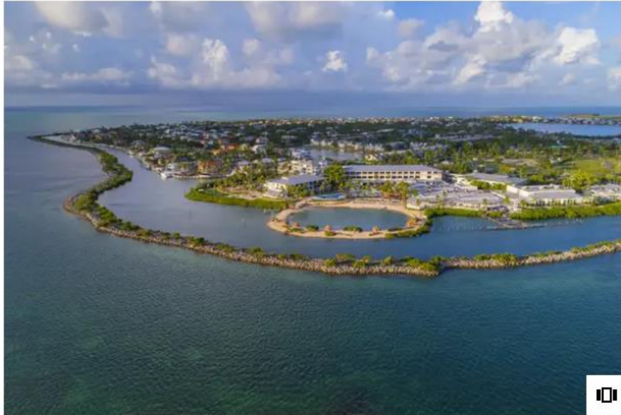
Duck Key (Hawks Cay)